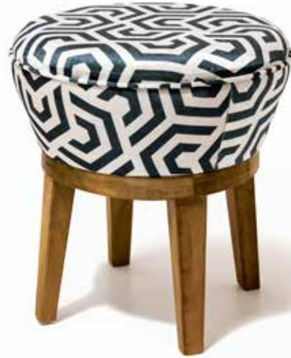
G/W : 42cm - D/D : 42cm - Y/H : 44cm