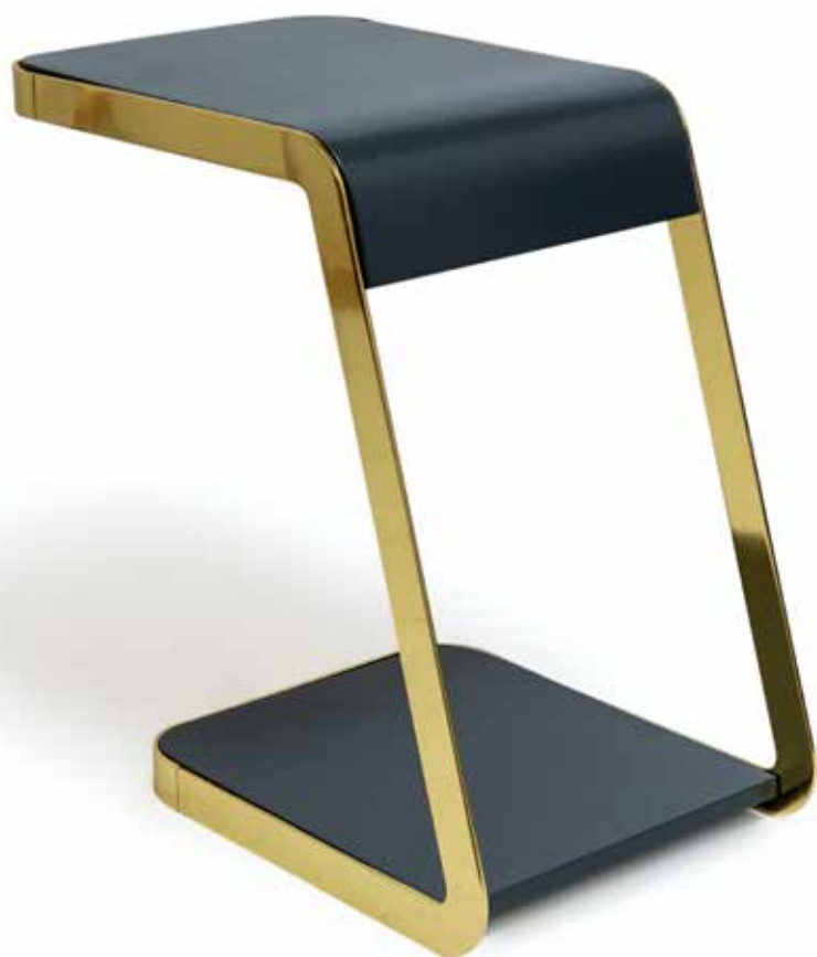
YAN | G/W : 40cm - D/D : 36cm - V/H : 60cm

Elegant folds and aesthetics by design draws attention. Simplicity and elegance of put together for those who want ideal