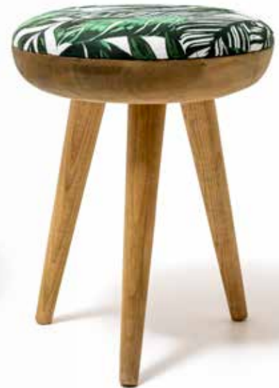
G/W : 35cm - D/D : 35cm - Y/H : 46cm