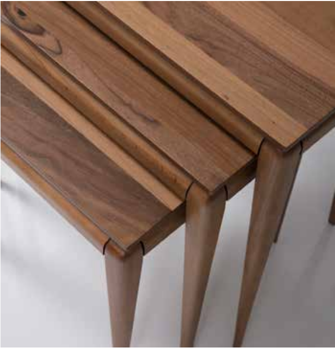
SERVIS | G/W: 60cm - D/D: 40cm Y/H: 52cm