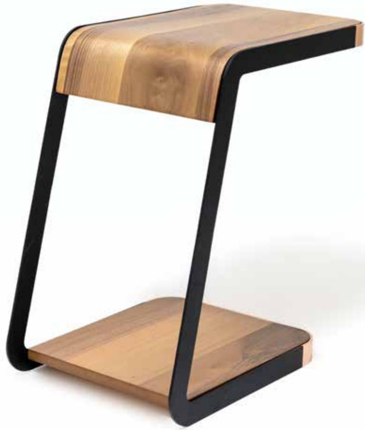
YAN | G/W : 40cm - D/D : 36cm - V/H : 60cm

Elegant folds and aesthetics by design draws attention. Simplicity and elegance of put together for those who want ideal.