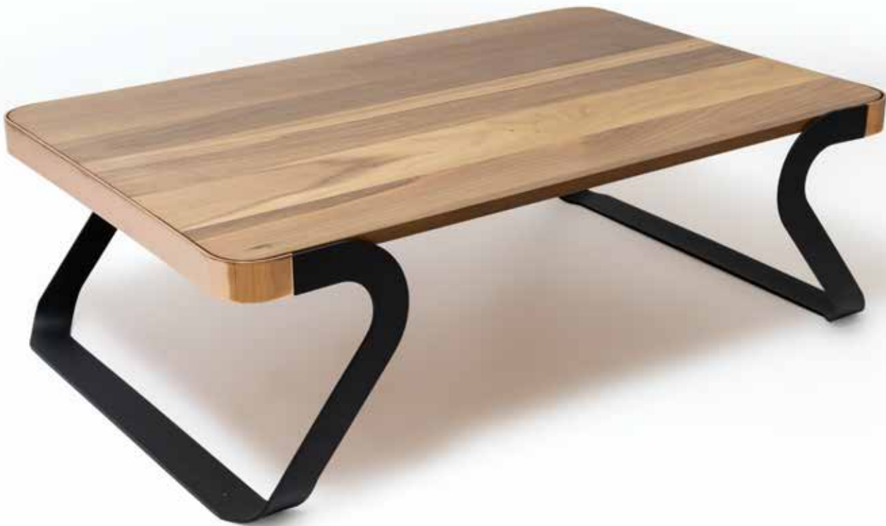
ORTA | G/W : 110cm - D/D : 70cm - V/H : 36cm