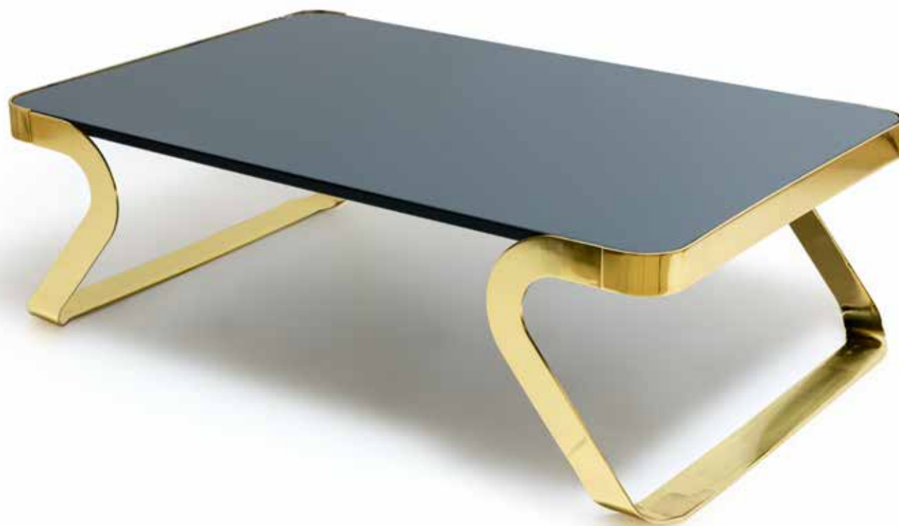
ORTA | G/W : 110cm - D/D : 70cm - V/H : 36cm