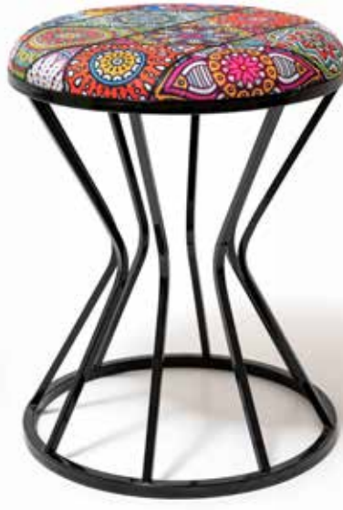
G/W : 38cm - D/D : 38cm - Y/H : 48cm