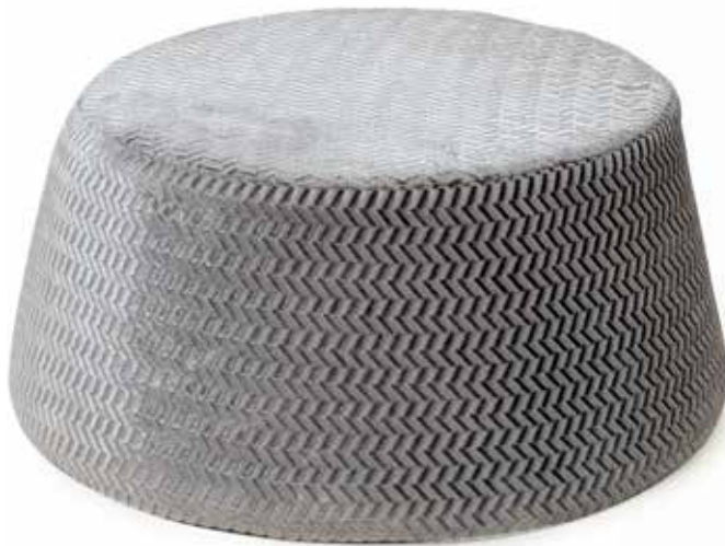
G/W : 66cm - D/D : 66cm - Y/H : 38cm