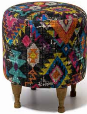
G/W : 39cm - D/D : 39cm - Y/H : 46cm