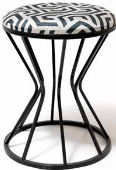
G/W : 38cm - D/D : 38cm - Y/H : 48cm